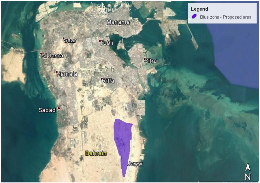
Figure (1) Selected Zone for Future Landfill