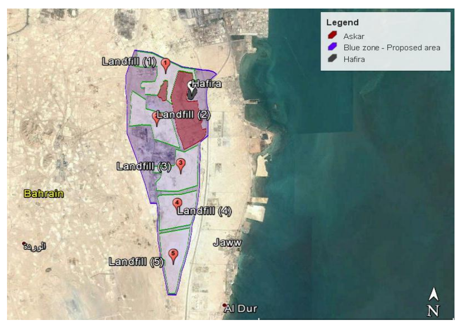
Figure (2) Landfill Sites' Alternatives